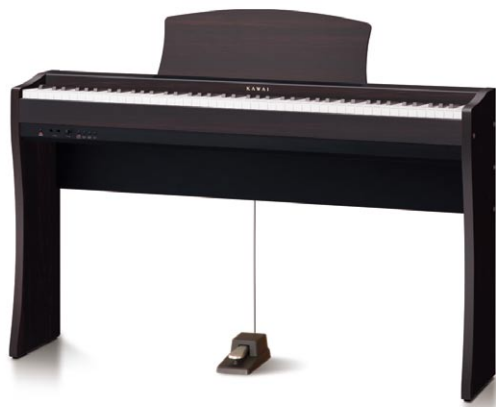
CL26 Premium Rosewood