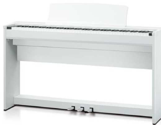
CL36 Premium Satin White